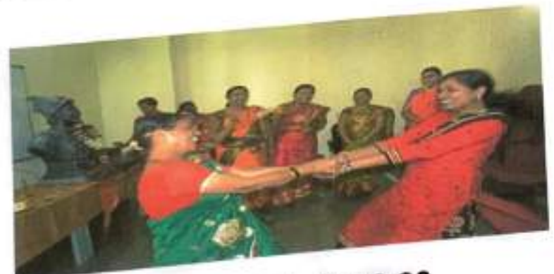
Marathi Bhasha Din 2019-20