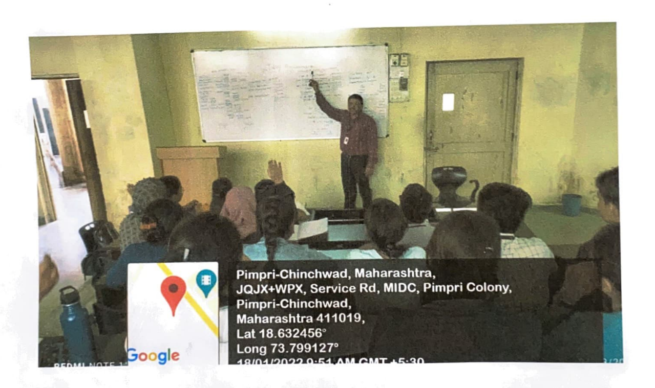
Computing Skill 2021-22