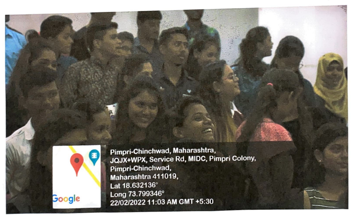
Guest Lecture 2021-22