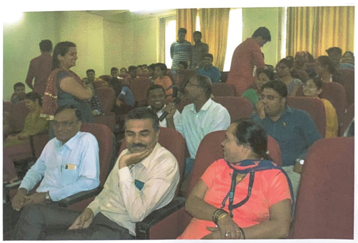
Marathi Din 2021-22