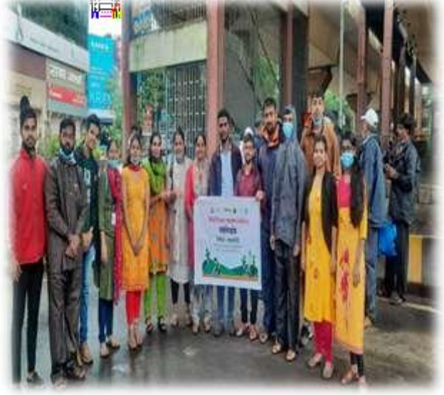
“Swacha Bharat Abhiyan”