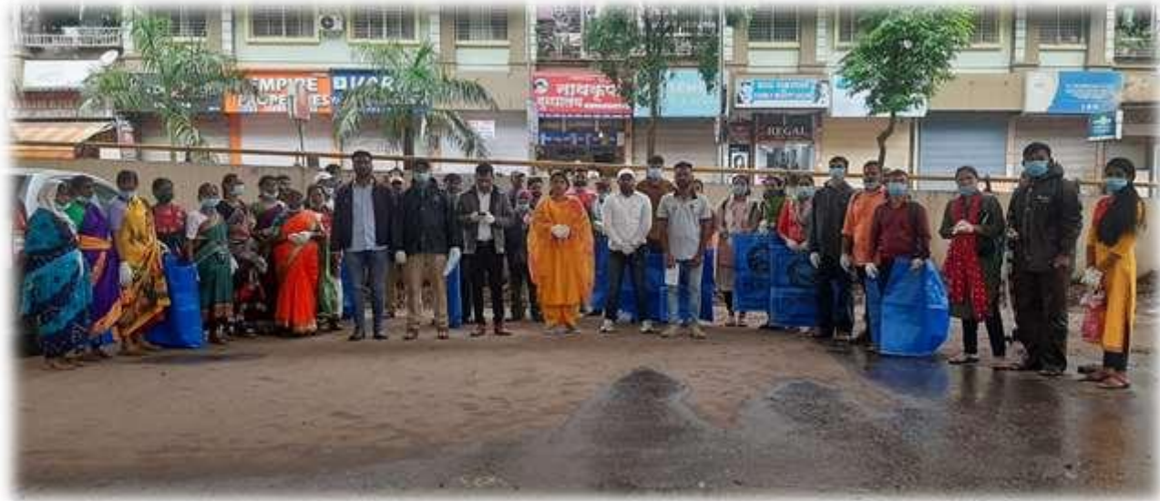
“Swacha Bharat Abhiyan”-2022 organised by PCMC under the heading SAKAL-SWACHADECHI