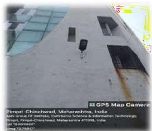
Solar lights installed in and around the college campus