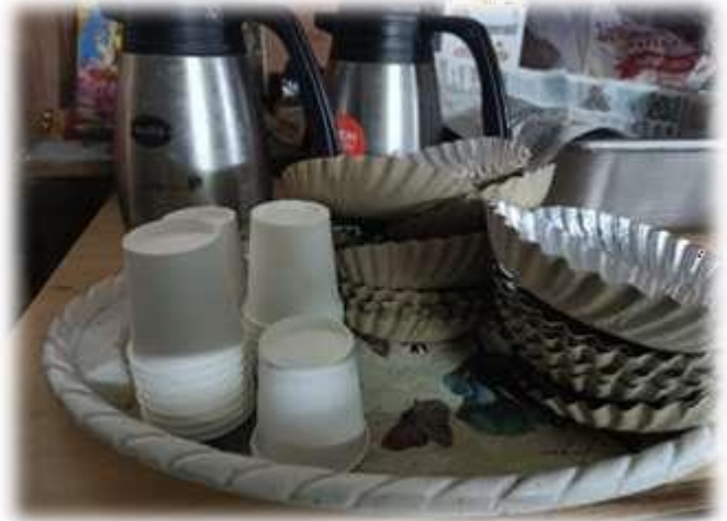
“Plastic Free Canteen&Campus”