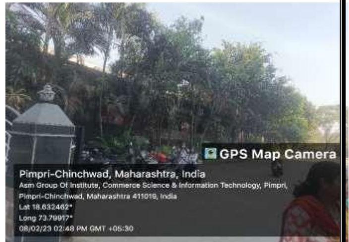
“Swacha Bharat Abhiyan”