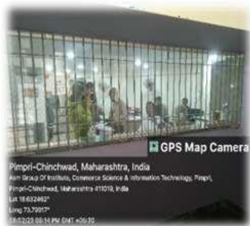
Use of LED lights in the College office