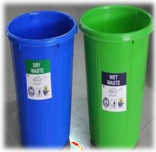
Solid Waste Management installed in the girl's restroom