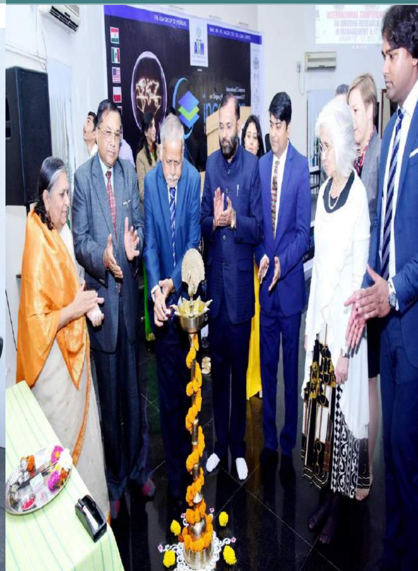
Poland, Italy, and Mexico, United States Foreign University Faculties attended INCON 2020