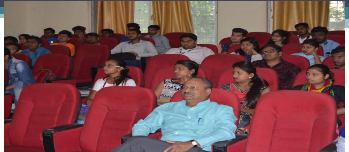
Prague University Faculties interacting with CSIT Students