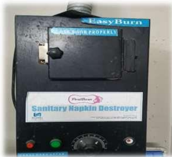
Solid Waste Management installed in the girls restroom

The facilities in the institution for the management of the following types of degradable and non-degradable waste.