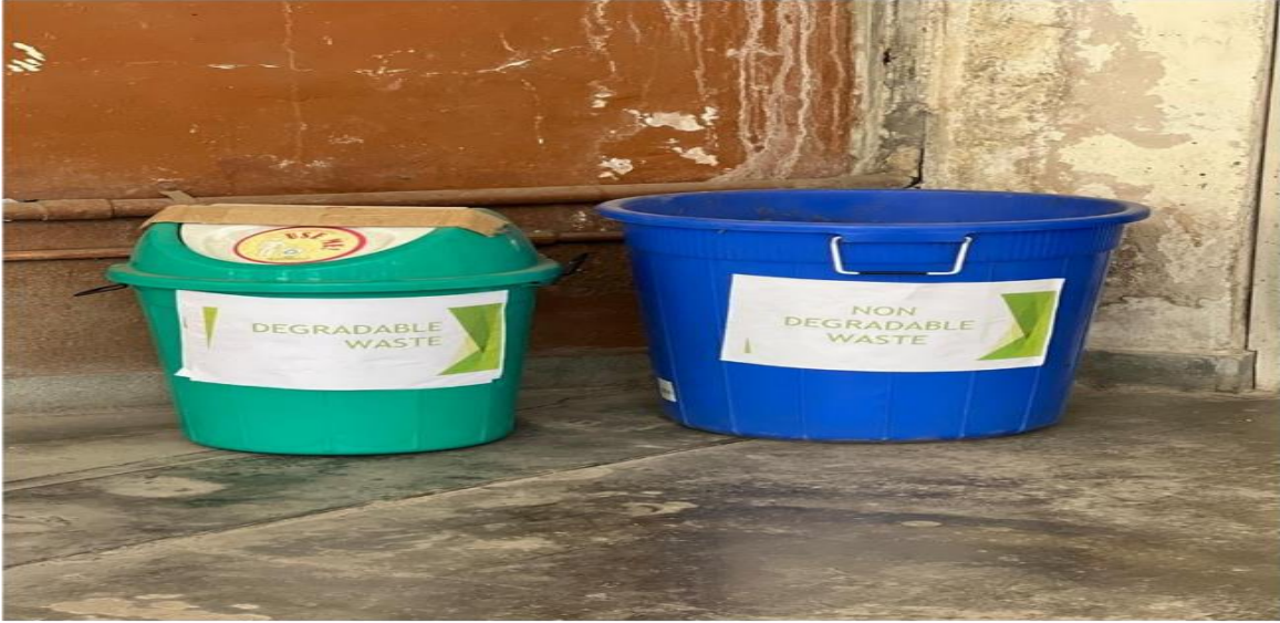
Separate, colour-coded bins