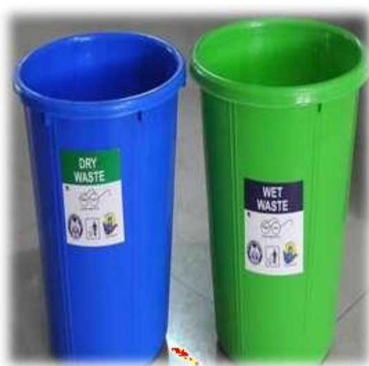
Dry and Wet bins keeps in every floor