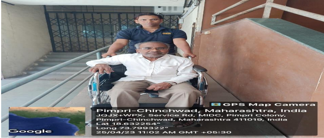
Human Assistant for disable people.