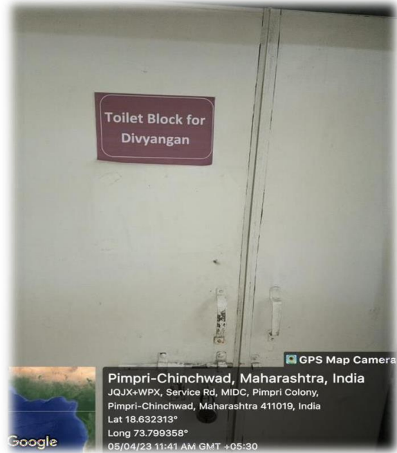
Disabled Friendly Washrooms