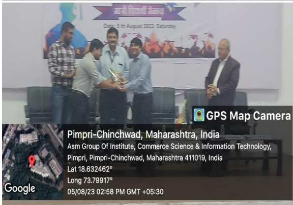
GPS Map Camera Pimpri-Chinchwad, Maharashtra, India Asm Group Of Institute, Commerce Science & Information Technology, Pimpri, Pimpri-Chinchwad, Maharashtra 411019, India Lat 18.632462° Long 73.79917° 05/08/23 02:58 PM GMT +05:30