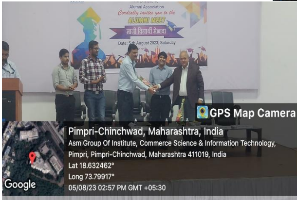
GPS Map Camera Pimpri-Chinchwad, Maharashtra, India Asm Group Of Institute, Commerce Science & Information Technology, Pimpri, Pimpri-Chinchwad, Maharashtra 411019, India Lat 18.632462° Long 73.79917° 05/08/23 02:57 PM GMT +05:30