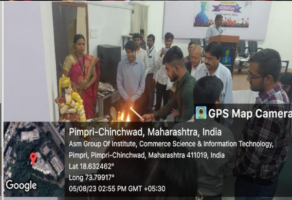
GPS Map Camera Pimpri-Chinchwad, Maharashtra, India Asm Group Of Institute, Commerce Science & Information Technology, Pimpri, Pimpri-Chinchwad, Maharashtra 411019, India Lat 18.632462° Long 73.79917° 05/08/23 02:55 PM GMT +05:30