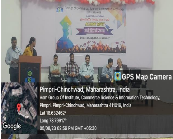
GPS Map Camera Pimpri-Chinchwad, Maharashtra, India Asm Group Of Institute, Commerce Science & Information Technology, Pimpri, Pimpri-Chinchwad, Maharashtra 411019, India Lat 18.632462° Long 73.79917° 05/08/23 02:59 PM GMT +05:30