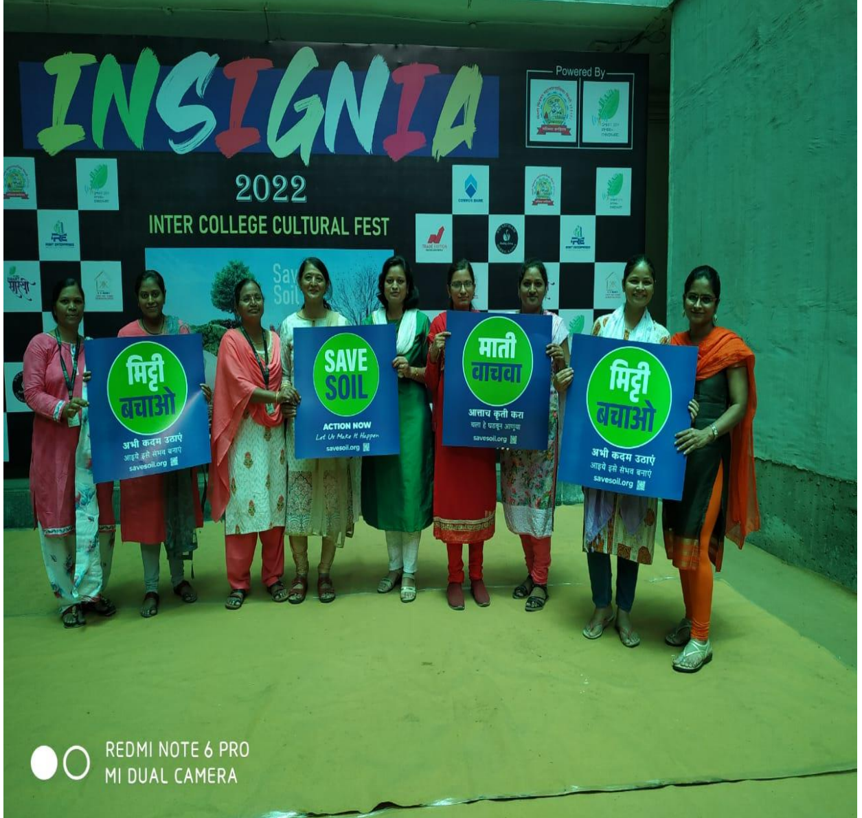
Save Soil poster